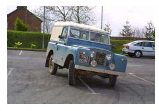
Pam Butterworth & Shon Gosling